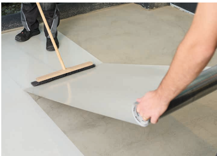
1) Lay nora dryfix ed on the subfloor