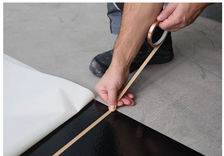
2) Bond the copper strip