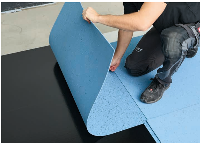
3) Install the floor covering