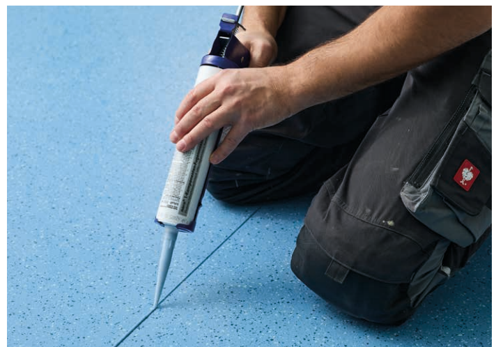
4) Weld the floor covering (where needed)